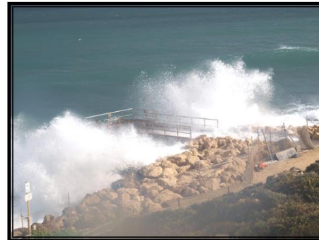
Wild weather at North Beach Headland's Jetty

Our volunteers are keen to have a go! Having a go and learning as we go is part of the fun!